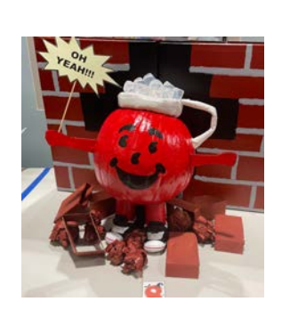
Traverse Area District Library Annual Report 2022 Page 3