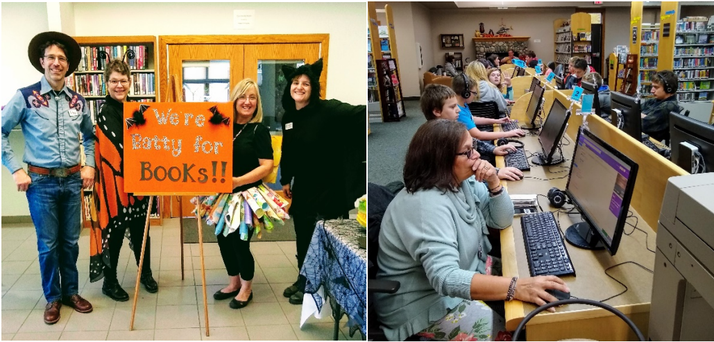
KBL staff in costume: